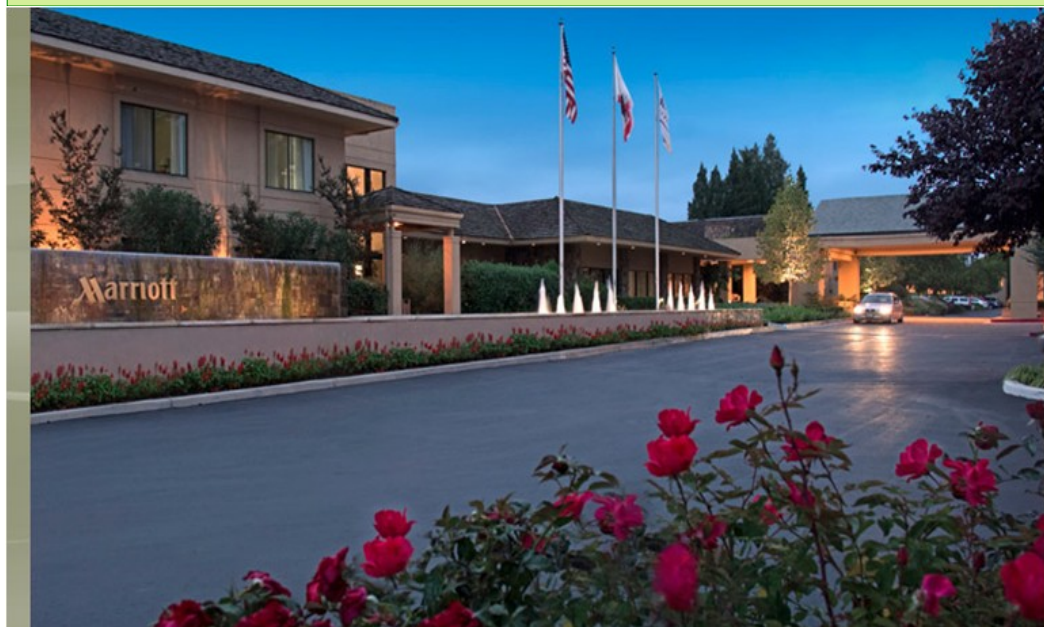
At the: Napa Valley Marriott Hotel And Spa